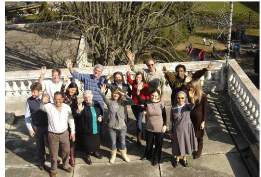
Participants and organizers of the 6 th training course.