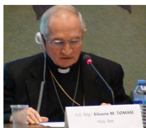
Mgr. Silvano Tomasi

The participants then heard the intervention of Mgr. Silvano Tomasi , the Holy See representative. He pointed out the importance of persevering efforts in favour of more than 100 million children worldwide who are still living in street situation. During his intervention, Mgr. Tomasi suggested three steps to combat the phenomenon: first, redesign the approach to a less formal and structured model of education according to actual needs of children in street situations; second, implement at national level a new legislation specifically designed for children and young people at risk ( juvenile legislation ); and finally, to promote a cooperative network among civil society organizations to look after the